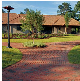
Clay Permeable Pavers