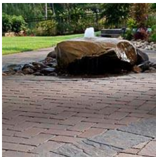
Aqua - Brick